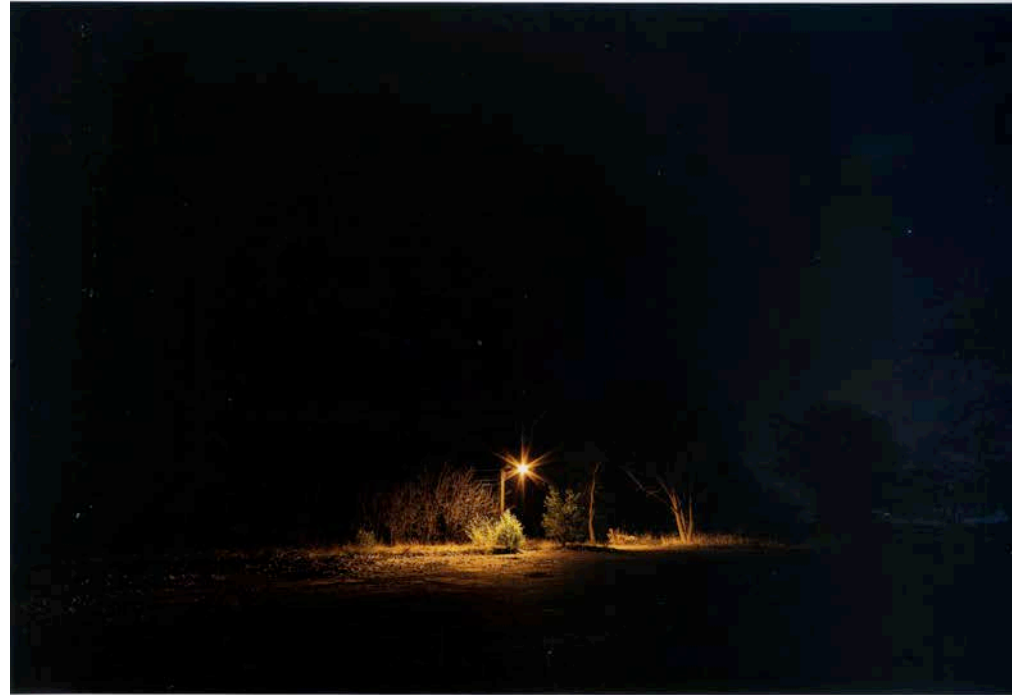
CAT. 17 SCOTT HOCKING Fox Creek Lamp, 2012