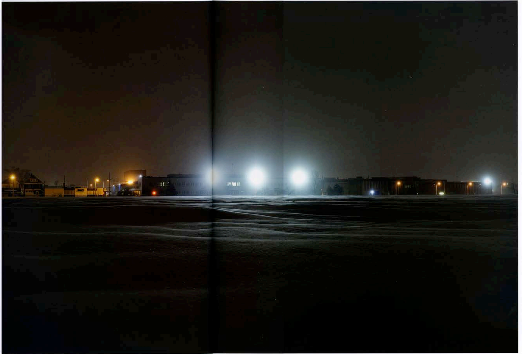
2 CAT. 14 SCOTT HOCKING American Axle, Snowdrift Seascape. Groundhog Day, 2014