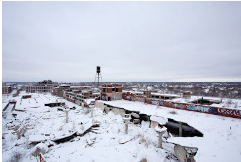
Garden of the Gods, Northeast, Snow.

Posted: 04/12/2012 3:30 pm - Vince Carducci