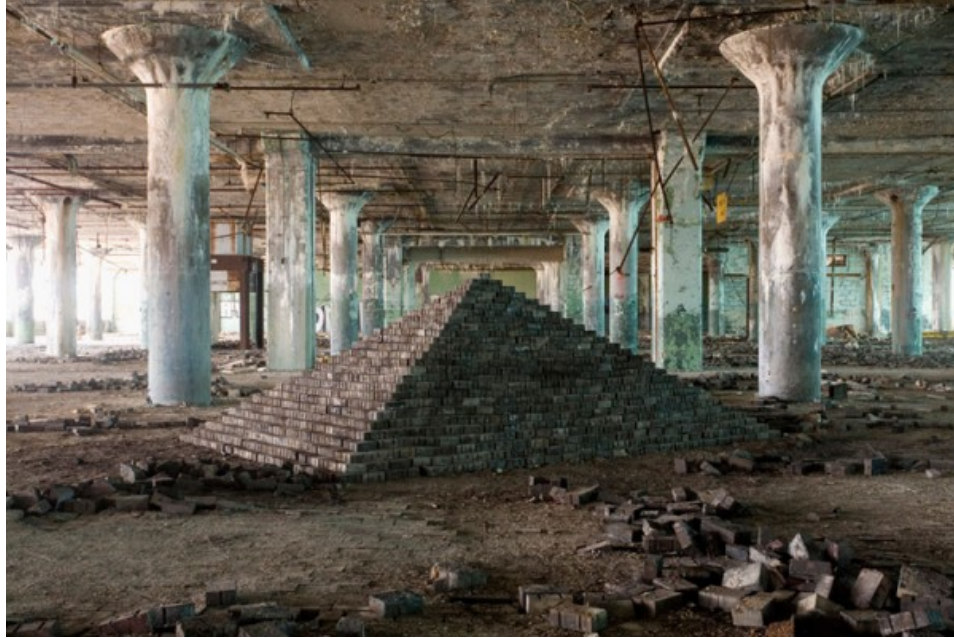
Ziggurat and FB21, 2007-2009

SMP: You seem to take an almost ethnographic approach to collecting data on decaying works of culture. Do you see yourself as an urban anthropologist in a way?