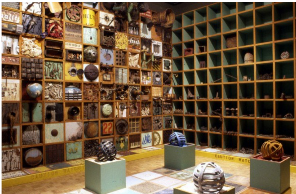
Relics, an installation at the Detroit Institute of Arts, 2001