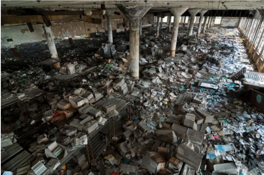
Roosevelt Warehouse and the Cauldron, 2007-2010

was through the process of taking these initial photographs that I became sensitive to the idea that I was just, as someone put it to me recently, “documenting survival,” and that wasn’t enough for me. So this path was good in the sense that it made me transition into photographing these places as larger installation projects. So now they’re just sets—I don’t have to create the whole environment, I just need to find the environment I want to create in. Other photographers will create environments in a vacant studio, and for me, my projects allow me to collaborate with buildings and collaborate with sites that I find mesmerizing. I know I’ve found a place to work in when I want to take a photograph of it alone. If I get that feeling, I think: Okay, this is where I’m going to build something. This is where I want to interact.