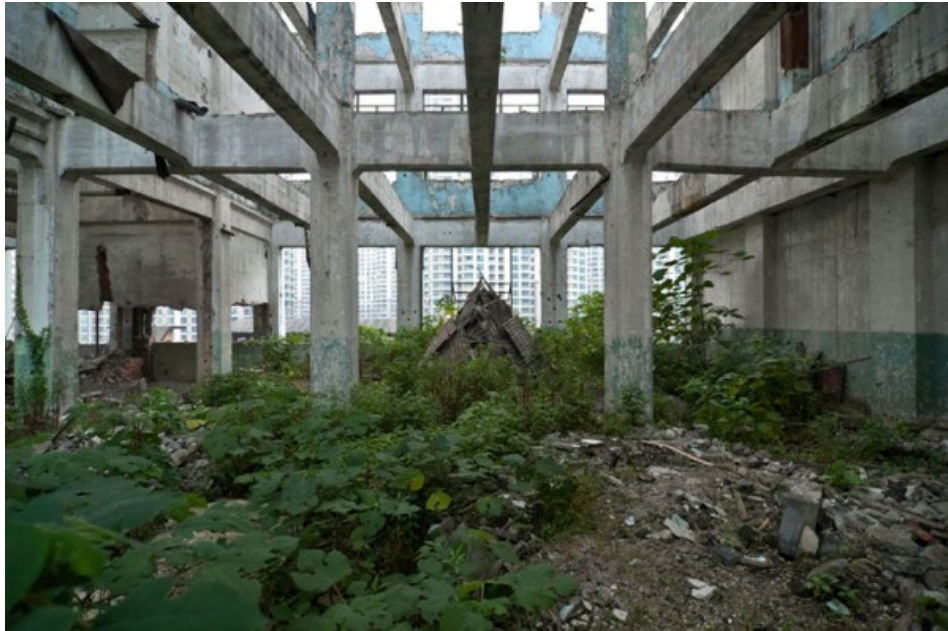
Lao Zhu and the Flour Factory, 2009

Human infrastructure can only withstand so much benign neglect before returning to nature. Much like the children of bohemian parents or the subjects of laissez-faire governments, the physical structures of built space will eventually succumb to wildness if left too long on their own. In no city is this process more apparent than in Detroit, where creeping vines engulf Victorian homes, trees sprout from the roofs of skyscrapers, and packs of wild dogs roam the streets. Nature has been slowly reclaiming the city for decades, disseminating a sense of wildness that many proclaim is a promise of renewal rather than an admission of failure.