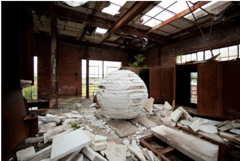
Sisyphus and the Voice of Space, 2010

In the end, it was all for an image, but I love the idea that people will come across the actual objects. That interaction is a significant part of the way I'm working now. I alluded to it earlier when I said that I'm attracted to places where there's a loss of control and a little wildness. Detroit is that kind of place. When I'm working on projects like this, there's also a loss of control in terms of what I might do. I can't come home to the studio every day and resume working on the same project. I'm going out to a building I don't own that could be torn down, burned down, destroyed, renovated, boarded up, somebody could have broken in and knocked over or spray painted what I'm working on, they could have added to it, or the materials I'm using could suddenly be gone. There are so many variables I don't have control over—a hell of a lot of chance involved. It's sort of like working on a sculpture, and every night putting it outside to see if someone stole it in the morning. It's a real freeing way of working... I just try and trust the universe.