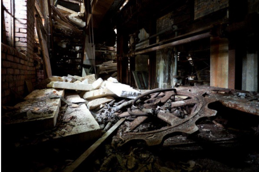
Sisyphus and the Voice of Space, 2010

I don't really like the idea of nostalgia, I prefer to focus on the present moment and find the beauty in how things are now opposed to looking back on how they were. I tend to work in buildings that aren't very personal—they're places of work—factories. There may have been thousands of people working and occupying the spaces where I am working at any given moment. These sites don't quite have that trace, or energy, that a house might—where people lived and slept, family members loved and grew up. I don't really work in places like that, and I think part of the reason is because of the memory—the idea of who they were is still very strong there, and you can feel it and see it sometimes. I think I shy away from that a bit.