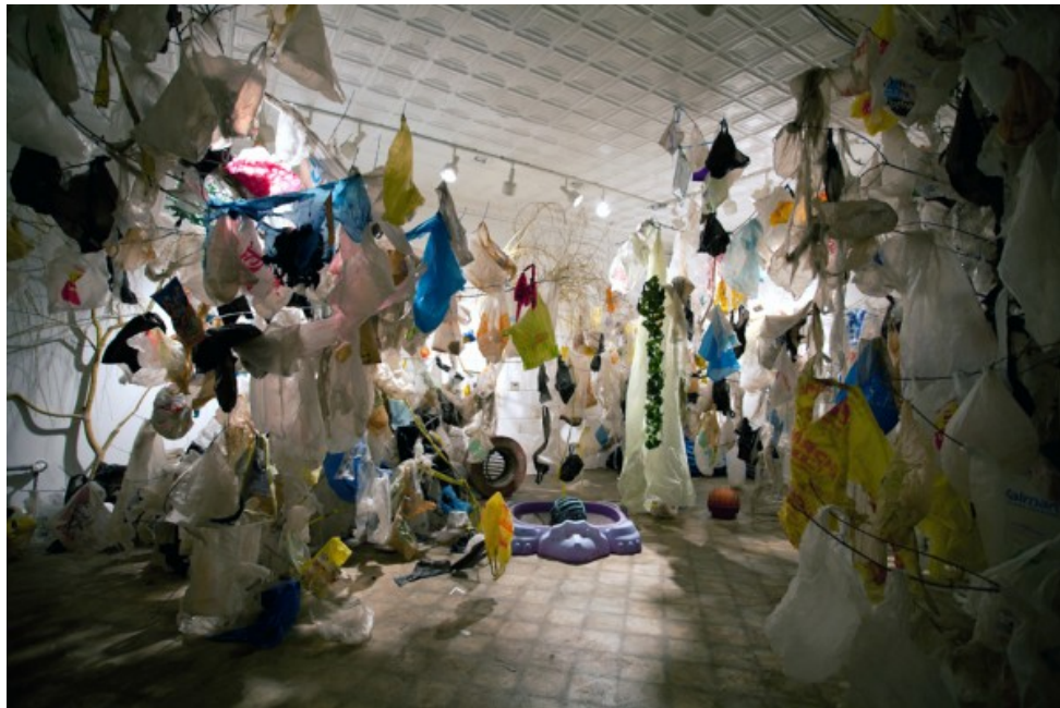
Tartarus, an installation at Public Pool Gallery, 2011

I don't really like the idea of nostalgia, I prefer to focus on the present moment and find the beauty in how things are now opposed to looking back on how they were. I tend to work in buildings that aren't very personal—they're places of work—factories. There may have been thousands of people working and occupying the spaces where I am working at any given moment. These sites don't quite have that trace, or energy, that a house might—where people lived and slept, family members loved and grew up. I don't really work in places like that, and I think part of the reason is because of the memory—the idea of who they were is still very strong there, and you can feel it and see it sometimes. I think I shy away from that a bit.