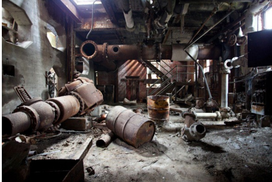
Sisyphus and the Voice of Space, 2010

Sarah Margolis-Pineo: The most immediately striking attribute of your work is your depiction of site. Your photos have this other-worldly quality, like we're looking at bacteria blooming on a Petri dish rather than an actual place. Working internationally, you must see quite a bit, and I'm wondering how you select where to work. What is it about these sites that you find compelling?