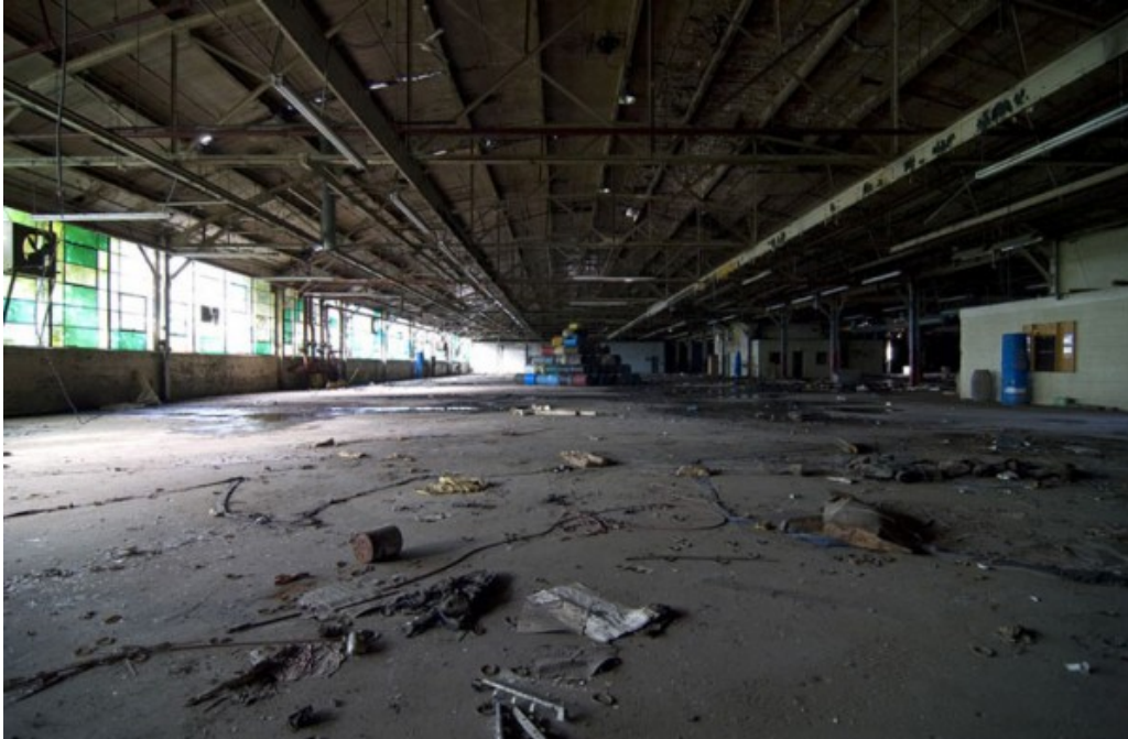
New Mound City, 2010

SMP: In a way, your work forges new pathways through forgotten places, exposing fissures in the traditional urban network. It brings to my mind the Situationist tactic of dérive —the practice of walking “off the grid” in search of an unmediated, authentic experience within the urban landscape. Would you describe your process as an act of resistance?